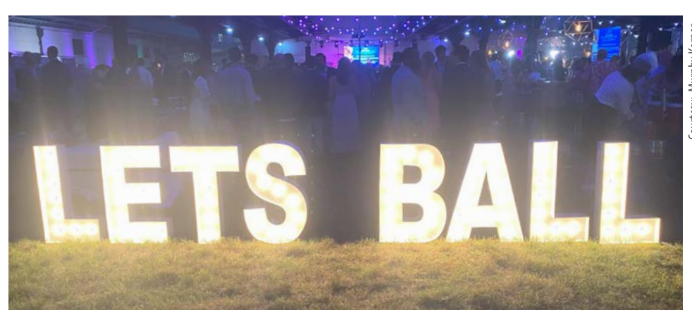
Richmond 2023 Brewer's Ball.

Embodying the YLD commitment to public service and collegiality, Askin and Novak each raised thousands of dollars for the Cystic Fibrosis Foundation ($5,000 for Askin and nearly $4,000 for Novak) and participated in a months-long program of CF education, awareness-building, and networking with other